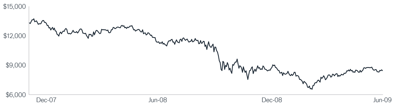
Daily closing levels for the Dow Jones Industrial Average from 12/3/07 - 6/30/09

During the recession beginning in 2007, the extreme dips in the market made it hard for investors to see beyond the volatility. In such difficult times, it's not easy to look past the current state of the market and focus on the long term.