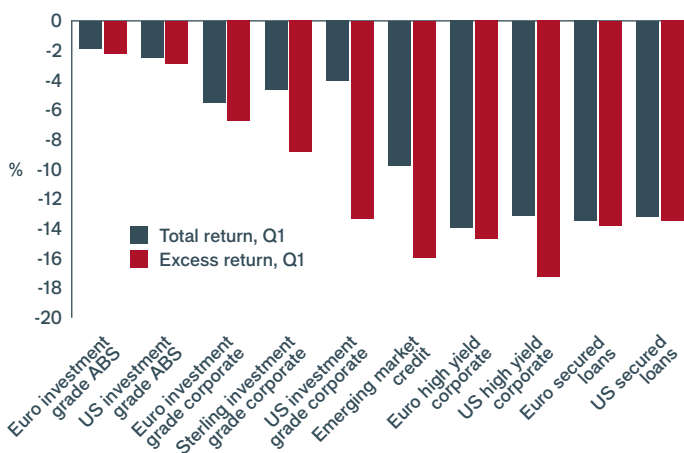
Chart 1: selected credit index returns – Q1 2020