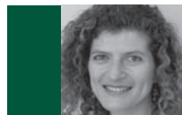
Mary Ann Sieghart