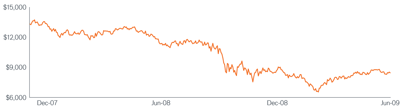
Daily closing levels for the Dow Jones Industrial Average from 12/3/07 - 6/30/09

During the recession beginning in 2007, the extreme dips in the market made it hard for investors to see beyond the volatility. In such difficult times, it's not easy to look past the current state of the market and focus on the long term.